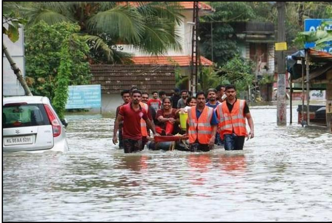
Figure 4: Kerala Fire and Rescue Services Personnel at work in flood-hit Chengannur

*Source: (UAE has not officially announced any financial aid for Kerala relief: envoy, THE HINDU, 2018)