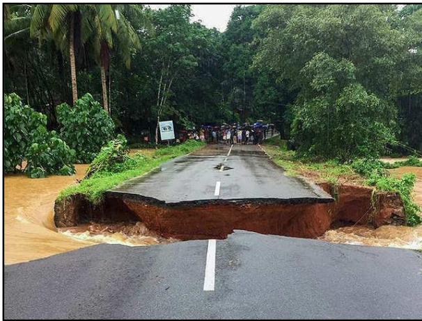
Washed away road