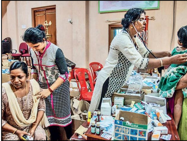
Figure 6: Medical checkups at a relief camp in Chengannur