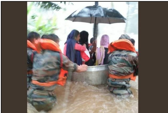
Figure 5: Army personnel used ingenious ways and used utensils and pipes to rescue women and children